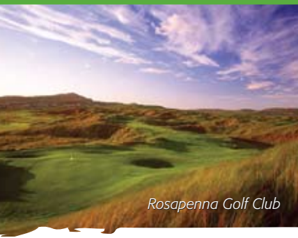
Rosapenna Golf Club