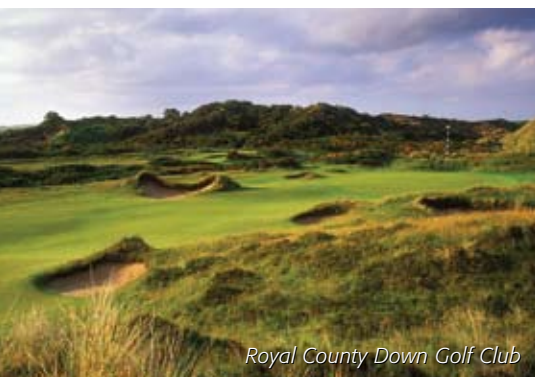
Royal County Down Golf Club

Our Challenge format is based on 2-person teams, Stableford Scoring – better ball. The best score for each hole will count as the team score. Maximum handicap utilized for scoring will be 24 for men, 28 for ladies. Overall winners will be the teams with the highest accumulated points over the four tournament rounds. Daily team Prizes to be awarded: 1st Net; Overall team prizes awarded: 1st, 2nd & 3rd Net and 1st & 2nd Gross. We look forward to welcoming you to a week of fantastic golf, great hospitality, fun competition, and as the Irish would say, great "craic"!