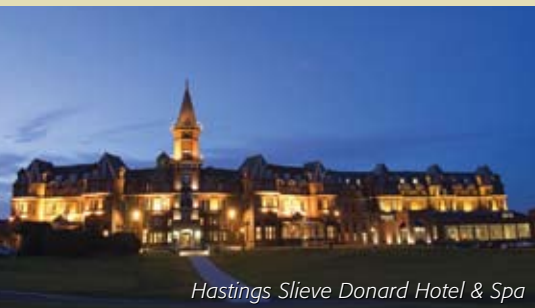
Hastings Slieve Donard Hotel & Spa