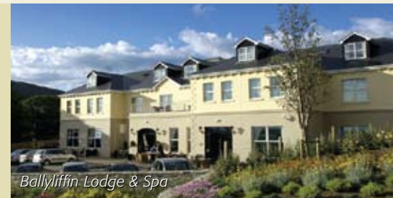
Ballyliffin Lodge & Spa

overlooks the famous Royal County Down Golf Club, where you can relax in the oak paneled drawing room with its fabulous central fireplace or enjoy a drink in Chaplin's Bar. Each guest-room has been tastefully furnished with many offering magnificent views of the Mourne